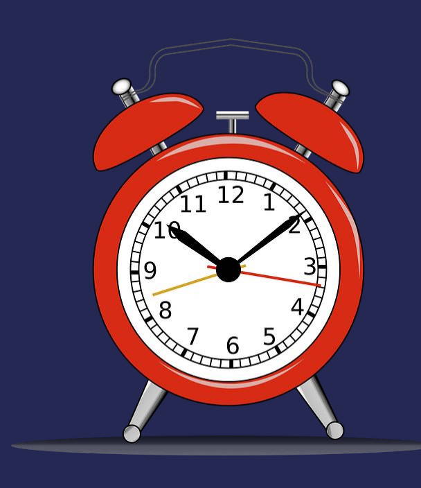
God's Wake Up Call