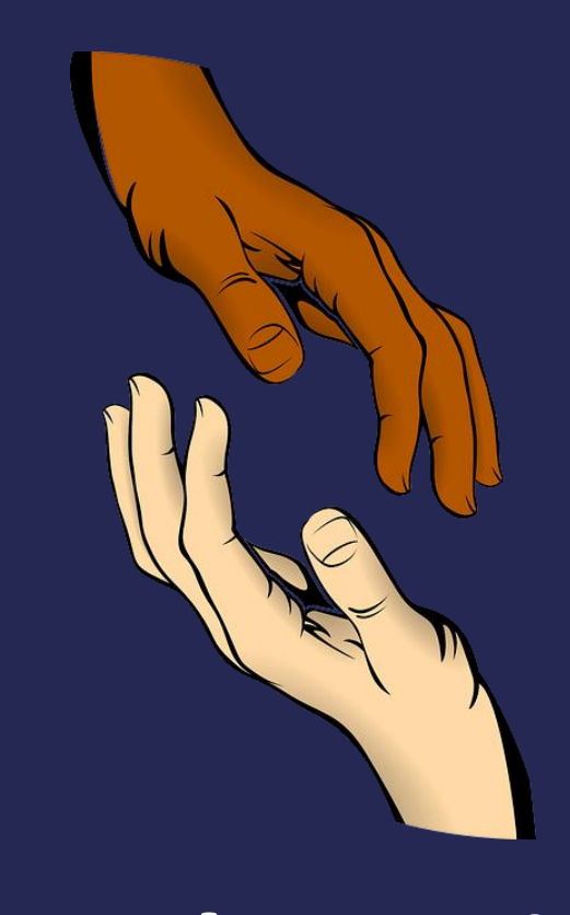
God Is Going All Out For You