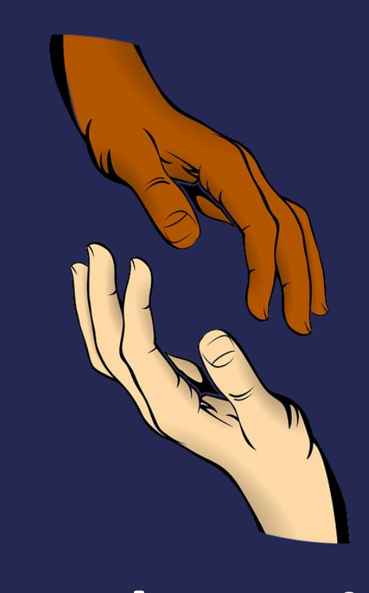
God Is Going All Out For You