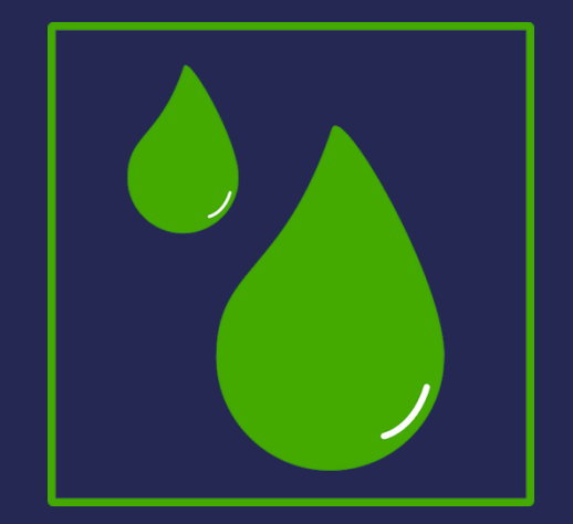
Sadness Over the Past Hag. 2:1-5