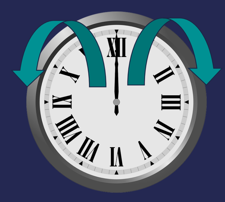
God Timelines It