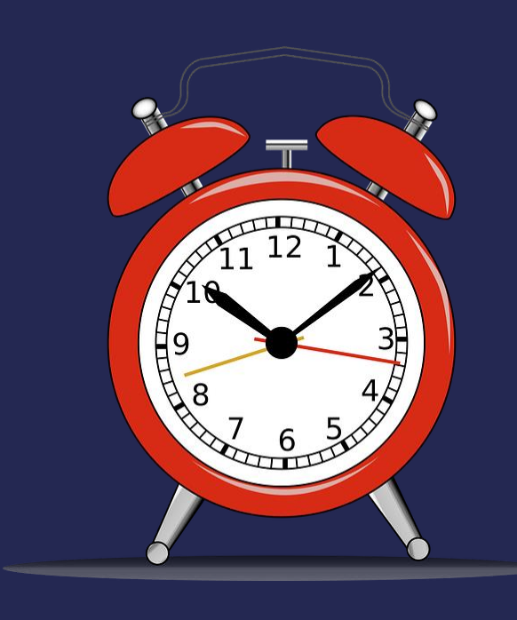
God's Wake Up Call