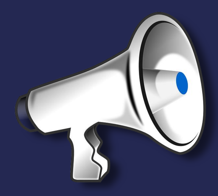
God Sent A Messenger