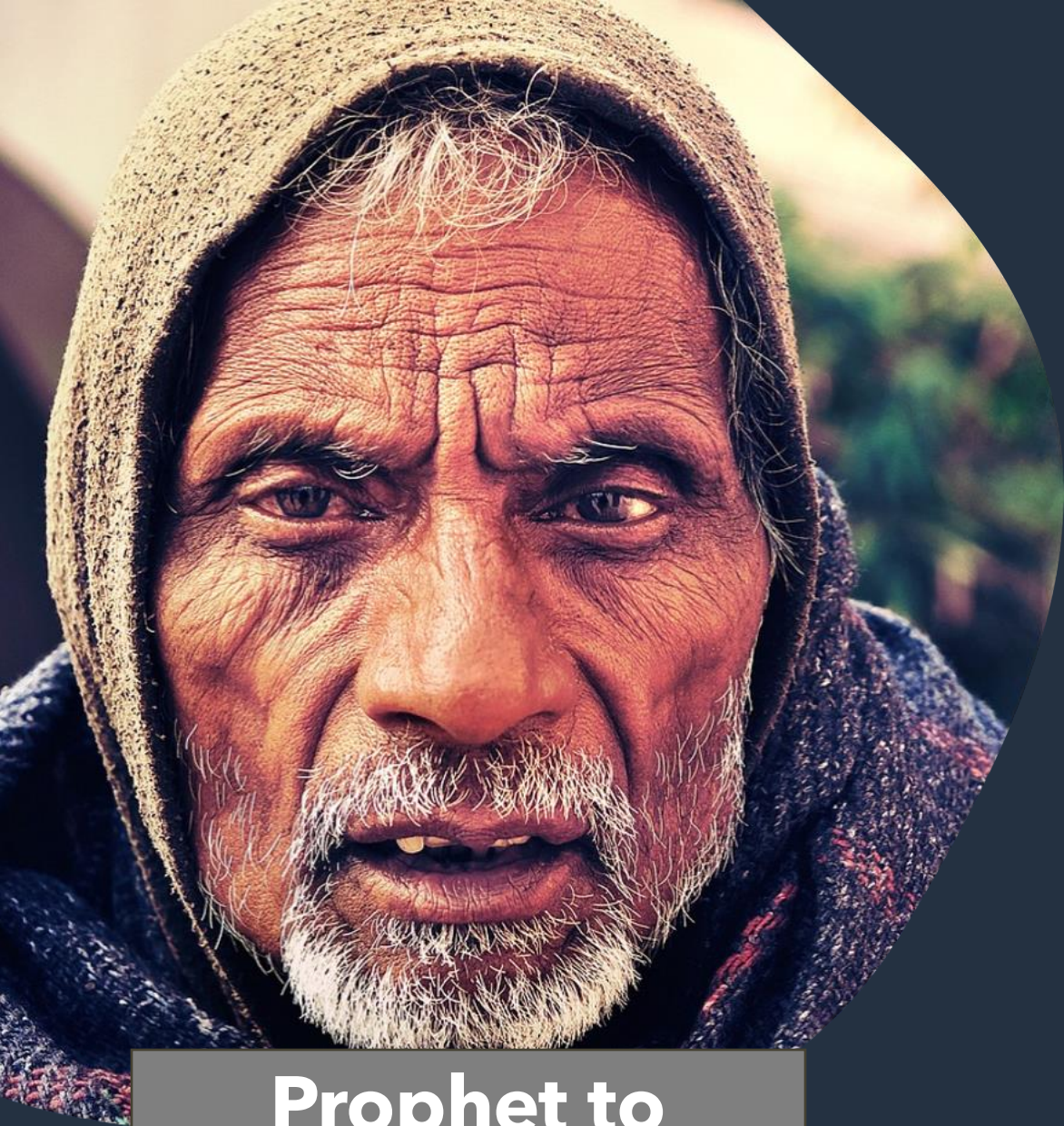
Prophet to Ninevah