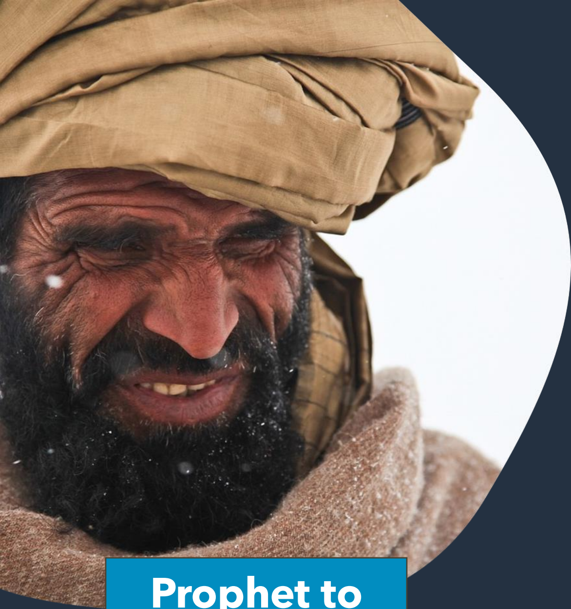
Prophet to Judah